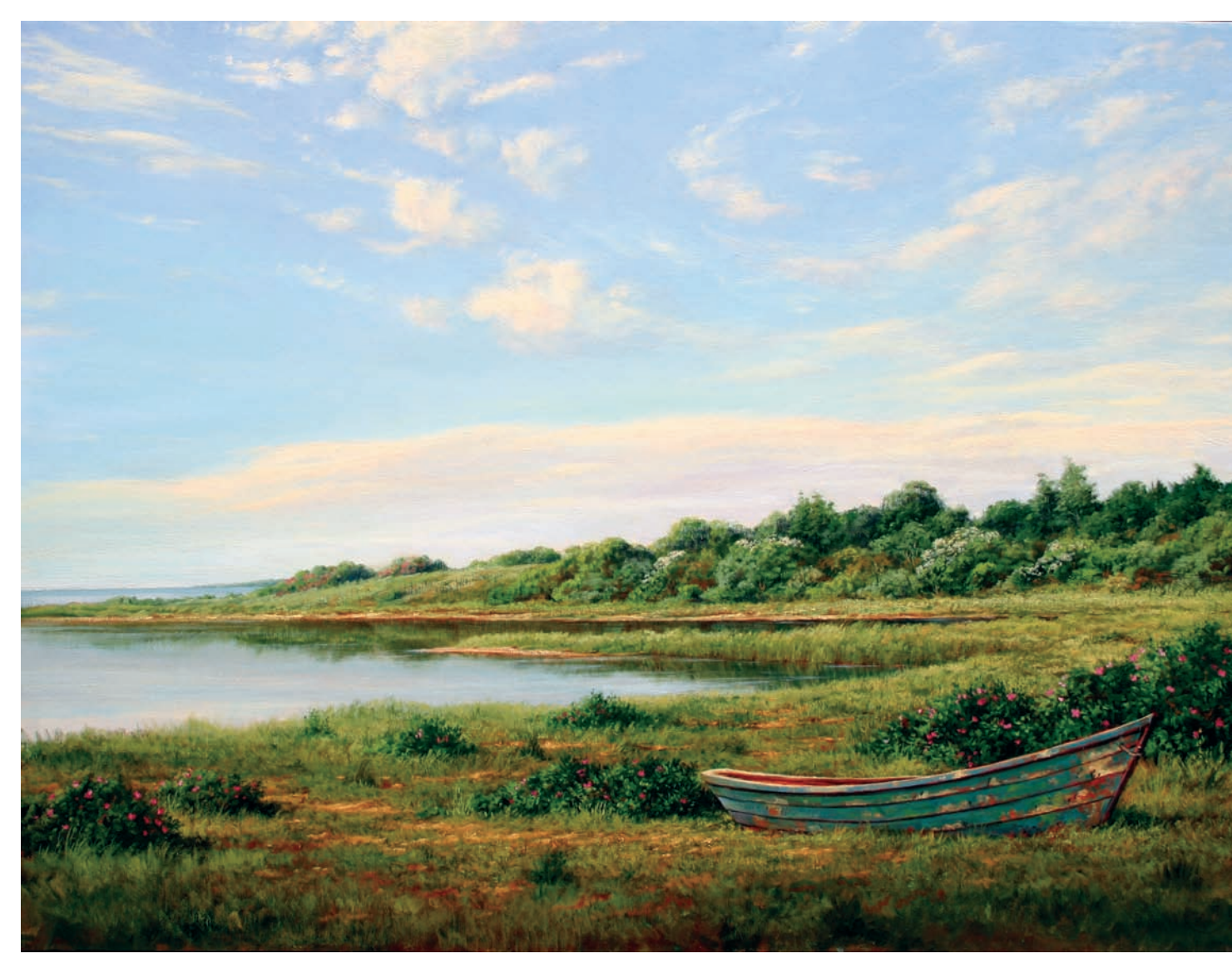
OLD FRIEND, OIL ON CANVAS, 30 X 40"