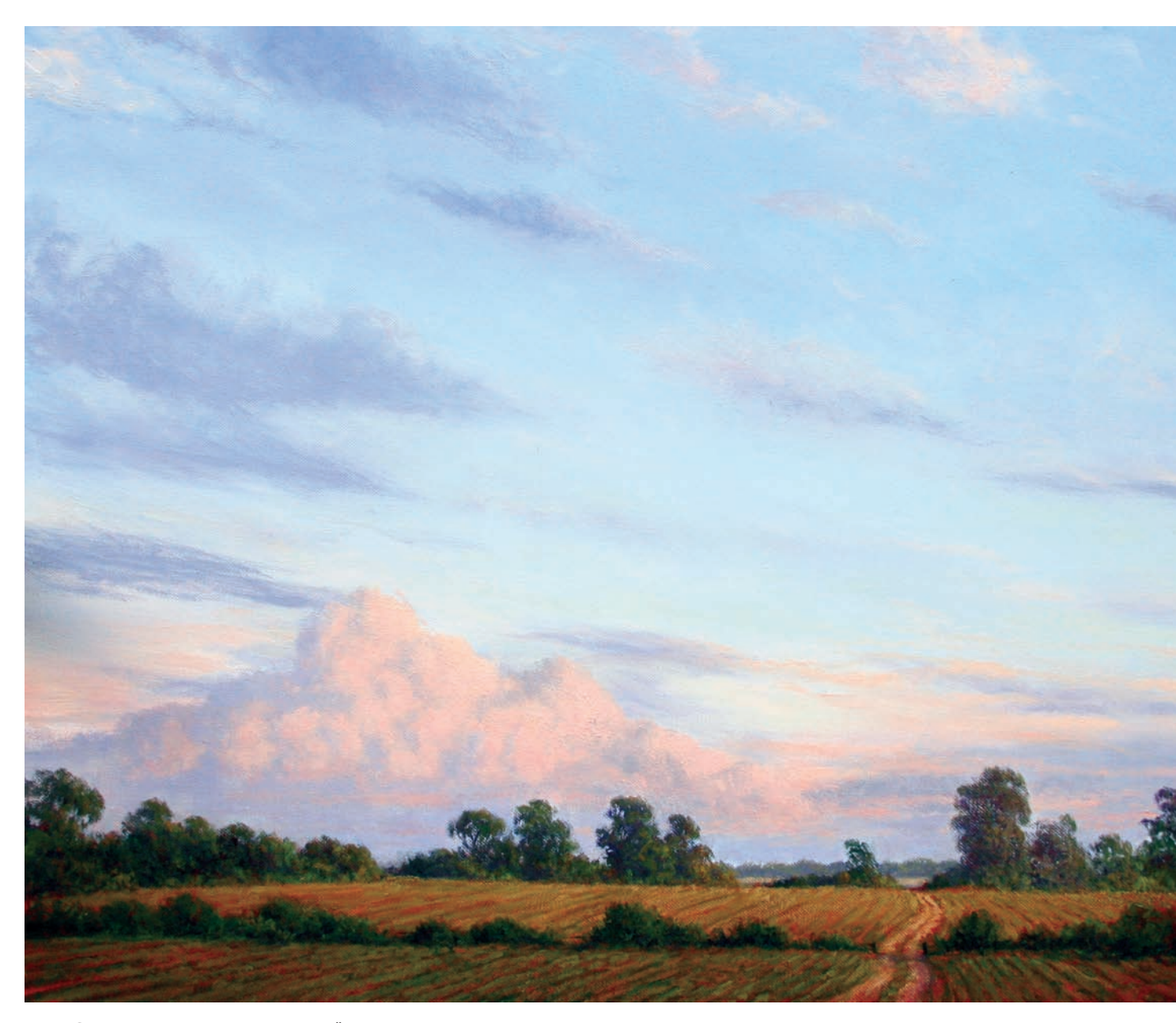
New Crops, oil on canvas, 20 x 24"

"A love of the outdoors is my constant inspiration, whether it is the golden hills or mountains of California, the wonderful light in Tuscany, an old stone wall in England or the quaintness of Nantucket, there is always more to paint than time to do it."