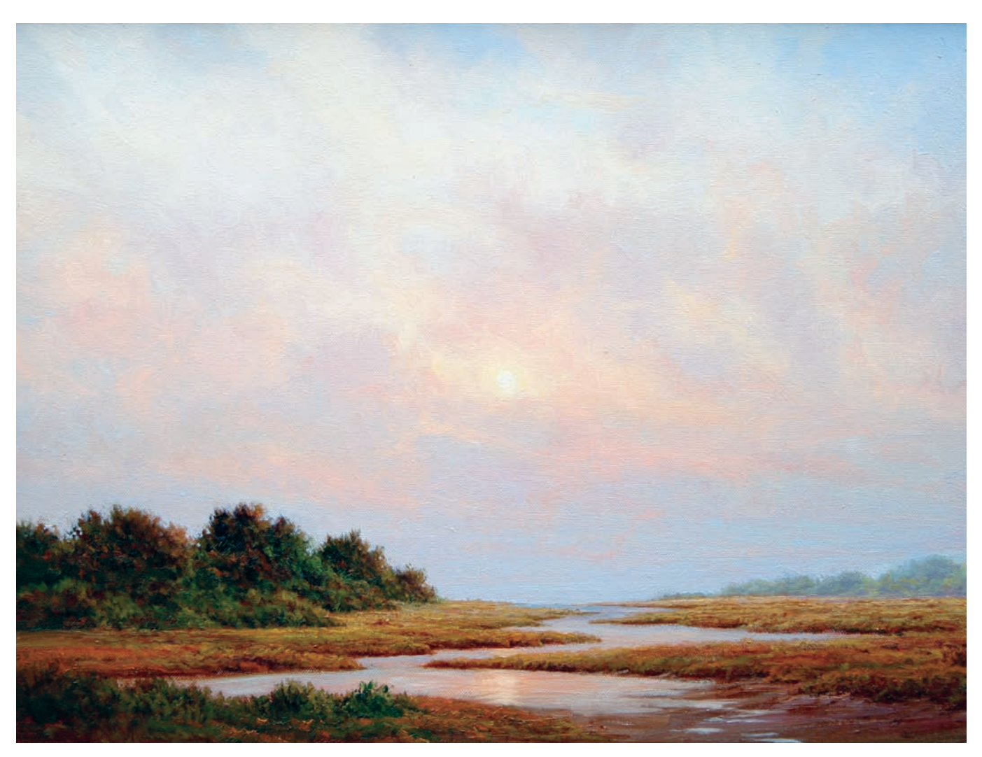
MISTY SUNSET, OIL ON CANVAS, 18 X 24"

just walk for three or four minutes out the front door and you'd be in these great open spaces. That's what I've found in Santa Barbara with the Douglas Preserve so close."